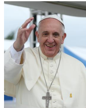
Pope Francis Pope, Roman Catholic Church